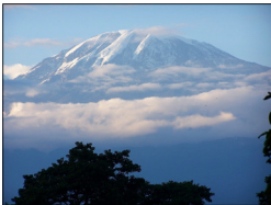
View of Kilimanjaro from Uhuru Hotel