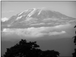
View of Kili from Uhuru